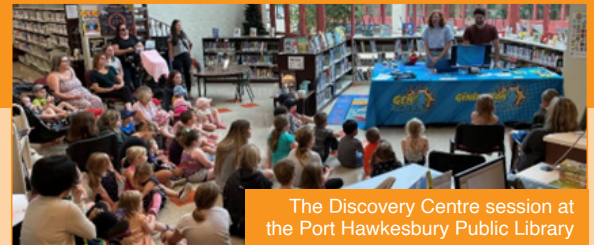
The Discovery Centre session at the Port Hawkesbury Public Library

Thank you to community members and organizations across the Counties of Guysborough, Inverness, and Richmond for your support!