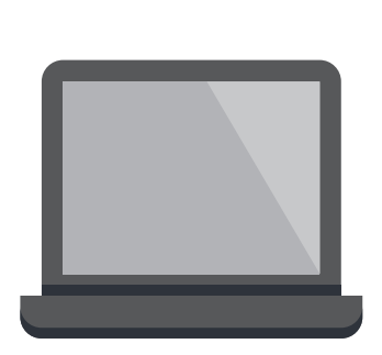
34,695 Website visits