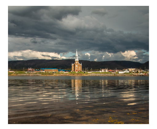
We're preparing to open a new location in Cheticamp