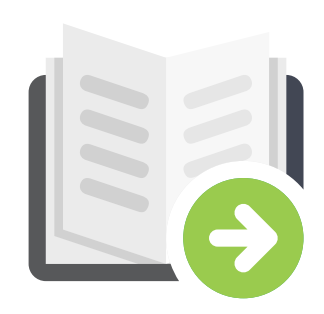
43,343 Physical check-outs