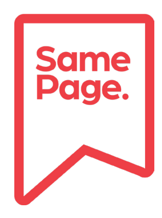
We're preparing for the implementation of a new catalogue system