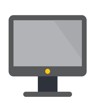
1,494 Public computer hours