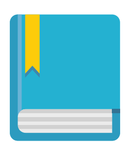
79,232 Items in Physical Collection