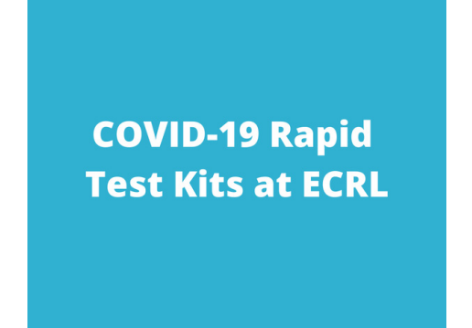
We distributed Covid-19 Rapid Test Kits to our communities